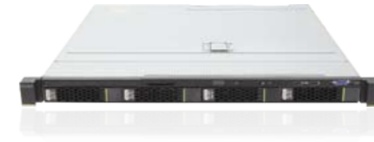
RH1288 V3 (4 hard disks)