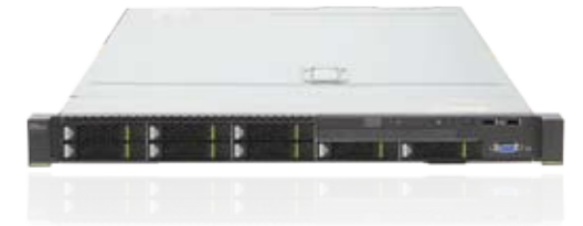
RH1288 V3 (8 hard disks)